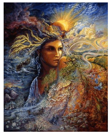
Spirit of the Elements by Josephine Wall

Celebrating the Seasons: Summer Solstice June 28, 2008